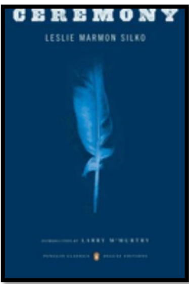
Ceremony , Leslie Marmon Silko