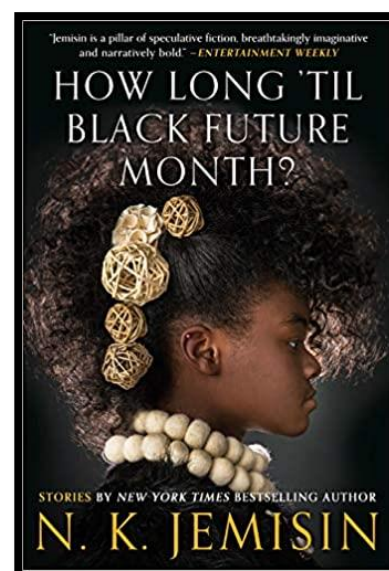
How Long 'til Black Future Month?: Stories, N.K. Jemisin

February 19, 10am - Circle the Block: A 5K Celebrating Black Health