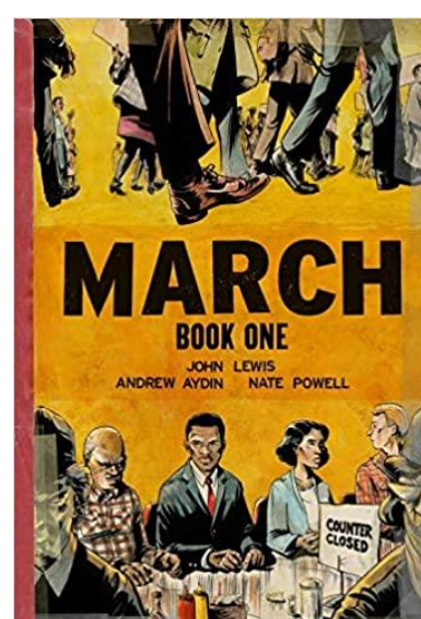
March: Book One , John Lewis

Register for the Human Rights Day virtual event hosted by the Seattle Human Rights Commission on December 9 th at 6:00pm .